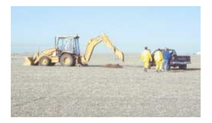
Figure 2. Backhoe constructing a soil sampling trench, October 1999, Fort Hall, Idaho.

In September 1999, personnel from the Shoshone-Bannock Tribes Agricultural Resources office and the NRCS (Idaho Falls) chose locations for soil sample collection. Choices for locations were based primarily on history of pesticide and cropland uses, variety of soil types, accessibility during fall and winter months, and landowner permission. Initially, four areas were