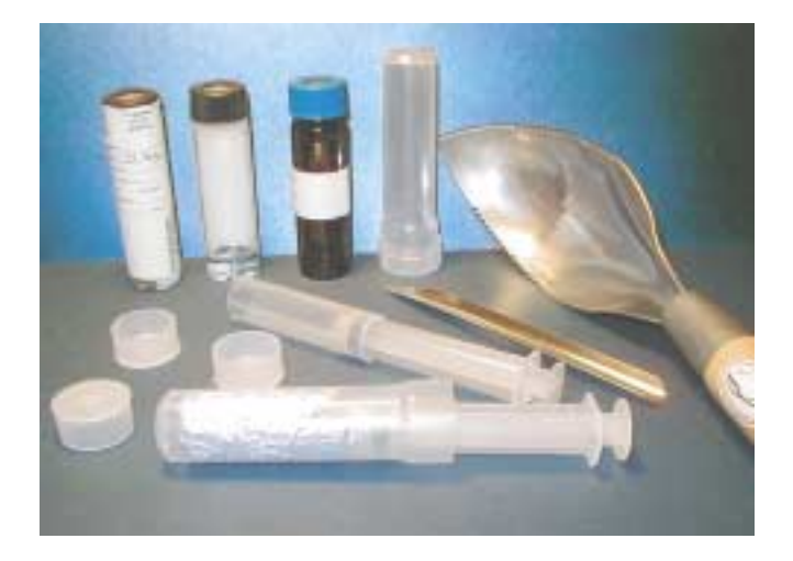
Figure 3. A set of soil sampling supplies.

A team of personnel from the USGS, Idaho Soil Conservation Commission, NRCS, Shoshone-Bannock Tribes, Idaho Department of Agriculture, and Western Agricultural Research collected the soil samples. The backhoe blade was cleaned with a hot-water,